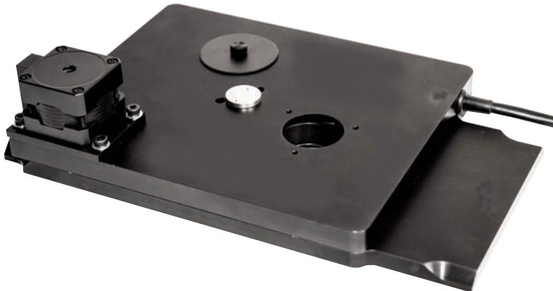
HF108IX3 filter wheel

Prior Scientific is pleased to introduce the new HP1719 IX breadboard and HF108IX3 filter wheel deck designed for the Olympus IX3 inverted microscope systems.