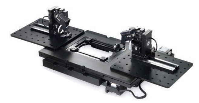
H117ACCM Stage Extension Wings shown with mounted micromanipulators

Increase the space available and add versatilty to your inverted ProScan H117 stage by adding the new H117ACCM extension wings. Produced in a breadboard format with 6mm taped holes at 25mm centers, these wings are ideal for mounting equipment such as Prior's micromanipulators by Sensapex without compromising the accuracy of the motorized stage.