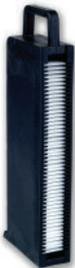
Solvent resistant slide racks hold up to 50 slides

The PL-200 accommodates up to four removable slide racks for 1x3 slides, each of which houses up to 50 slides for a total capacity of 200 slides. For 2x3 slides, the PL-200 accommodates two removable slide racks which house up to 20 slides for a total capacity of 100 slides. The slide racks are fitted with a convenient handle and a slide retaining design which means that slides can be moved around the laboratory in safety. Sensors on the PL-200 monitor the presence of the slide racks so the system can intelligently respond when racks are changed in the middle of a run for example. Upon detection of a newly installed slide rack, a unique slide detection system is able to automatically scan and identify the quantity of slides in the rack and their location.