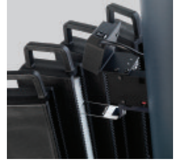
The precise slide gripper safely collects and returns slides

In addition, the presence of this height sensor allows the PL-200 to work seamlessly with advanced auto-focus routines which can then be used to maintain proper focus throughout the scan.