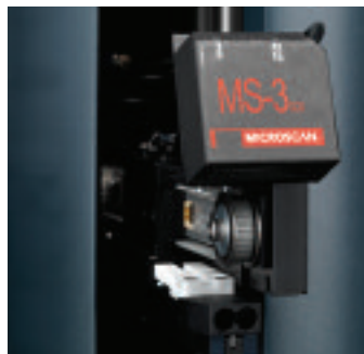
Bar code reader ensures data integrity