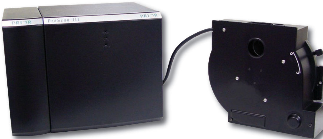
Image: HF6NTK six position Nikon turret kit shown with ProScan™III controller.

Please note that Prior will return all original manufacturers parts in order to retrovert system back to original manufacturer specifications.